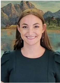
Katlyn Iacovino Josephine L. LiPuma Vocal Scholarship