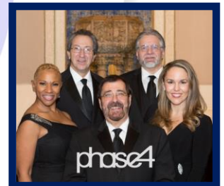
After Dinner Entertainment Phase4