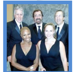
Dinner Entertainment Phase4