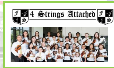
Cocktail Entertainment 4 Strings Attached