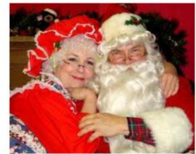
The Big Guy and his Boss!