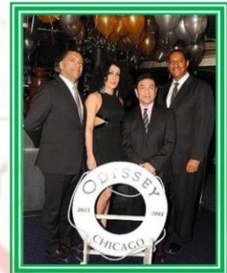
After Dinner Entertainment 4theBeat Band