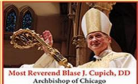
Most Reverend Blase J. Cupich, DD Archbishop of Chicago