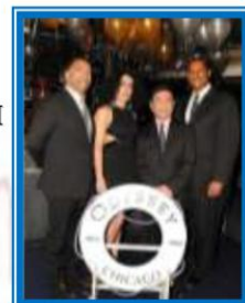
After Dinner Entertainment 4theBeat Band