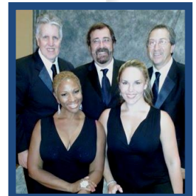
After Dinner Entertainment Phase4